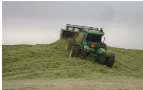
DIFFICULT PACKING SMALL GRAIN