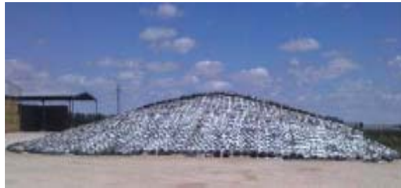
LARGER PILES AND FACES