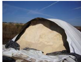
HIGH MOISTURE GRAIN